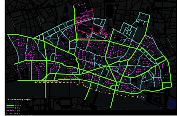
Plan indicating typical mounting heights