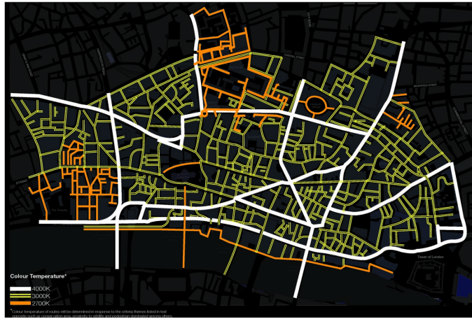
Colour Temperature plan