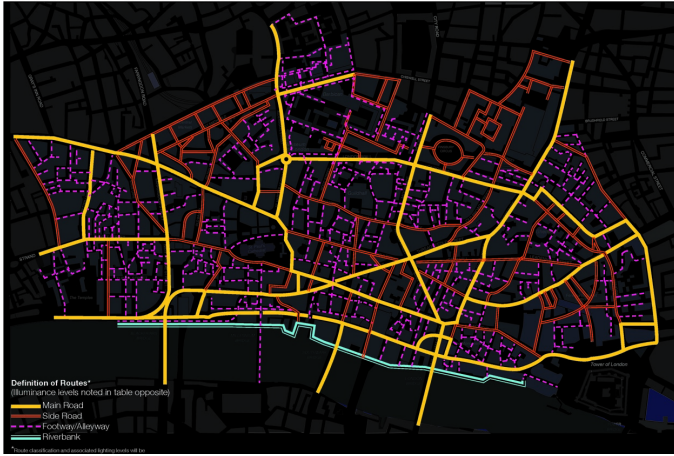
Plan indicating main and side roads, footway/alleyways and riverbank zones